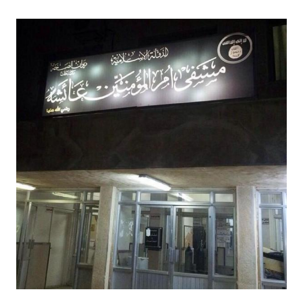
[Aisha, Princess of the Believers Hospital]

The Caliphate has undertaken vaccination programmes for children and infants.