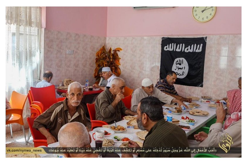
[Home for the elderly in Nineveh province]

Hence, the quality of public services has been bettered. The streets of Mosul are clean, empty of waste, the lights shine at night and life is refreshed.