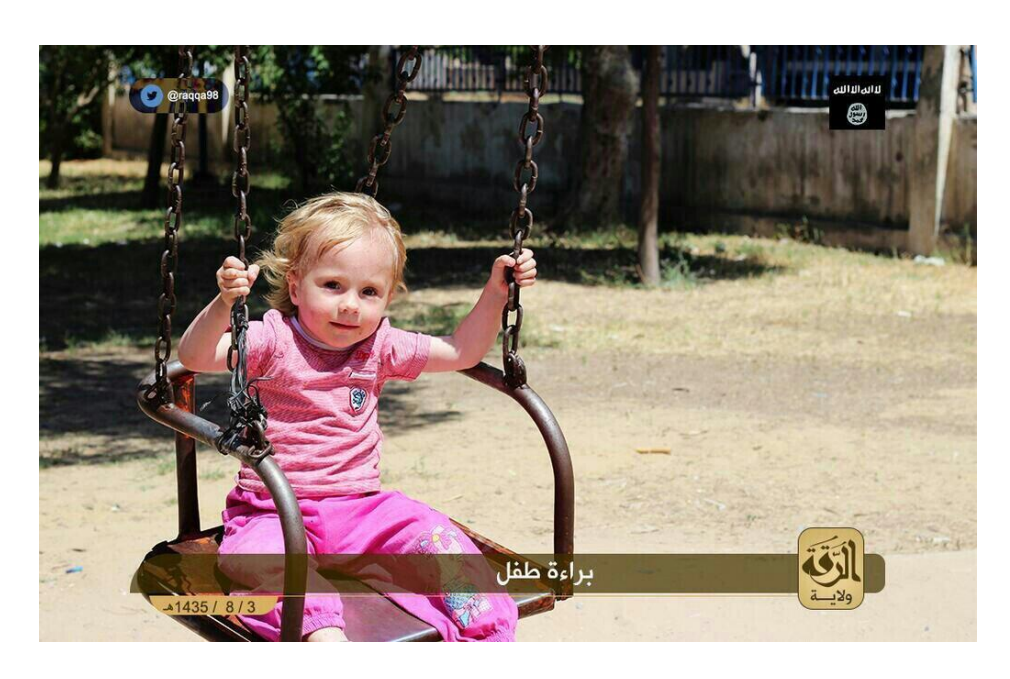
[Child in one of Raqqa's parks]

From the beginning of the "revolution" a number of fighting groups controlled the city, some secular, some Islamic, until, thanks be to God, the Caliphate was expanded to it, a point at which the people of the city and visitors to it witnessed the quality of life improve and stability rein, when the flag of the Caliphate flew over its roofs. We are not, out of respect, going to refer to the negative aspects of these groups or the mistakes that they made - they are not hidden from anyone who is still there. Rather, we only report on truths here and, foremost among them, is that the migrant families were faced with torment and extreme humiliation from the vengeful nationalists that dominated over the aforementioned groups. As for the rule of the Caliphate, they are Divinely protected and respected. Hence, the Caliphate took over Raqqa it presented them with special attention and thorough care because circumstances of migration on a person are harsh, indeed. The muhaajirat were most affected by this.