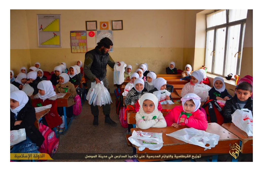
[Colouring pencils being handed out in school in Nineveh province]