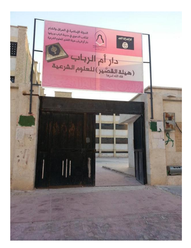
[Shariah college in Al-Bab, Syria]