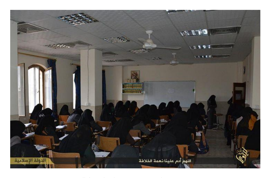
[All-female classes in Ninevah province]