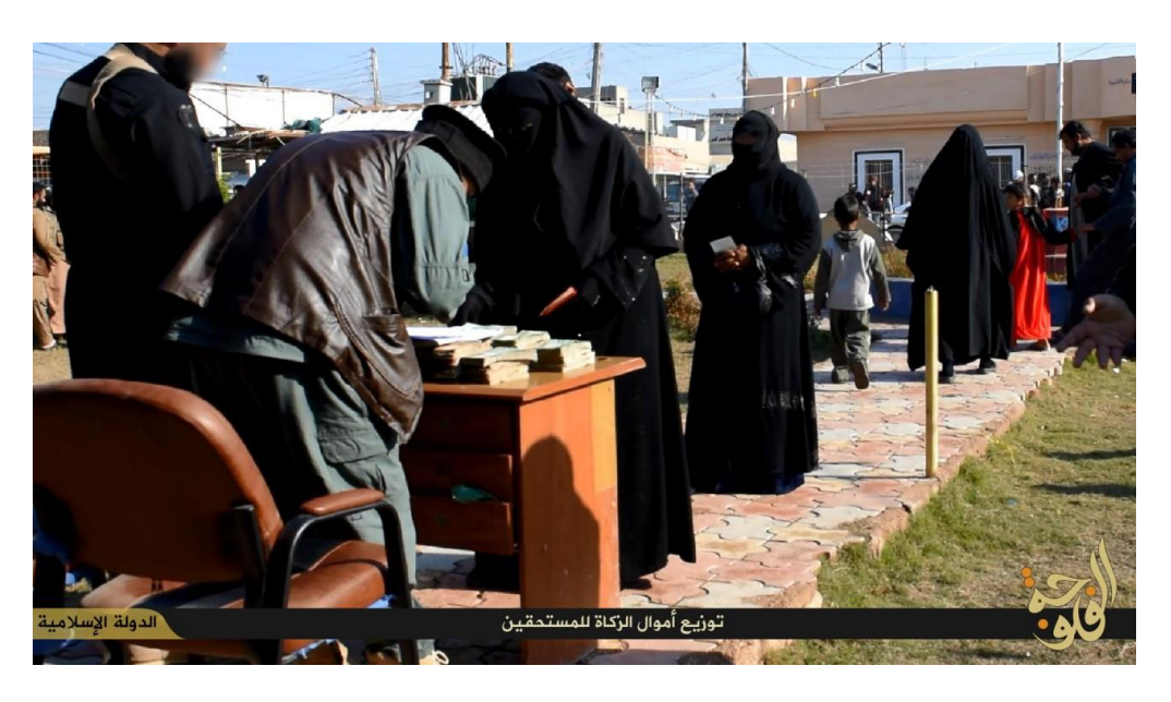
[The circulation of zakat in Fallujah province]

Women felt the effects of poverty more than men. It meant that they were not able to sustain themselves as easily as they should have been able to. It multiplied the misery that she felt towards her children and family, especially if the breadwinner was in jail, dead or absent, as is often the case in land of frontiers and garrisons in times of war. The current situation is something a woman would never have found during the time in which Shiite militias ruled over Nineveh, when she was forced to knock on the doors of strangers, asking for a crumb bread or a drink of milk. There was one kind person for the tens that turned her away. This miserable situation was obliterated by the Zakat Chamber, which was installed so women could take their rightful livelihood from it, which God guaranteed her and her children. Hence, all due respect and capability is given back to women and harm does not come to them, as was the case for the needy among the female Companions who were obliged to receive zakat and healthcare free of charge, in spite of the intensification of the financial circumstances in the day of the caliphate. This is more evidence of the good intentions of the Rightly Guided state in which the people are living while it is at its formative stages, living conditions were corrected internally, and it guarded them and fought off their external enemies.